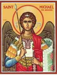
St. Michael the Archangel Our Angel of Protection