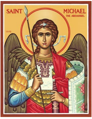
St. Michael the Archangel Our Angel of Protection