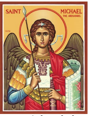
St. Michael the Archangel