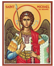
St. Michael the Archangel Our Angel of Protection

"A COMMUNITY OF FAITH DEVOTED TO STUDENTS"