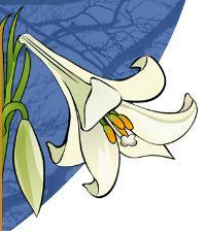
St. Kateri Tekakwitha