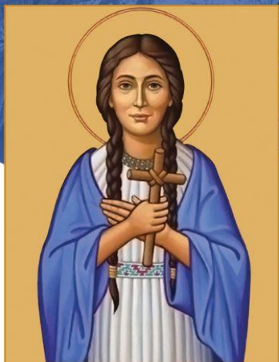
St. Kateri Tekakwitha