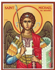
St. Michael the Archangel Our Angel of Protection